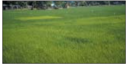
Leaves are yellowish-green in the omission plot where N has not been applied.