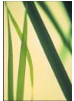
Leaves are smaller in N-deficient plants.